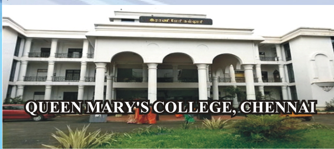
QUEEN MARY'S COLLEGE, CHENNAI

The vibrancy of the city is best witnessed at the Marina beach, known as the Pride of Chennai, which is the second longest beach in the world. The UNESCO World Heritage Site at Mamallapuram and temple city Kancheepuram are near Chennai, which attract tourists from all over the world.